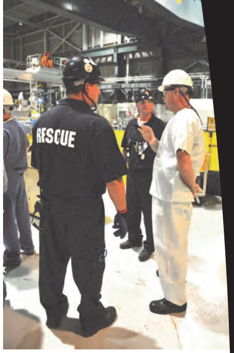
Rescue Team conferring with Plant personnel Nuclear facility, Lycoming, New York

OSHA 10-Hour; Fall Protection; Lockout/Tagout; PPE; and Hearing Conservation. All our team members are Emergency Medical Technicians as we believe a large part of our responsibility as a rescue team is to also be capable of providing first aid and emergency medical care to personnel at the site who may be injured or become ill during the course of their work there. The skills and professionalism our personnel exhibit everyday as professional firefighters are brought to industry in our rescue services and we take great pride in their capabilities, professionalism, and work ethics.